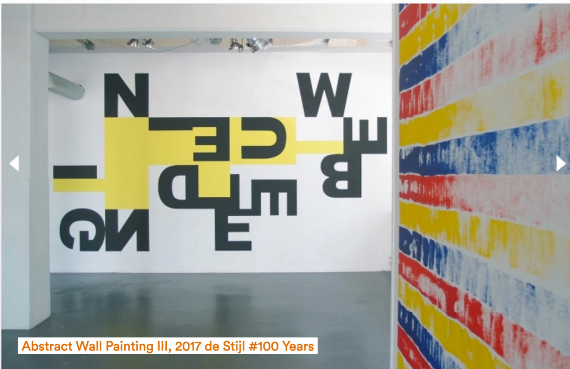
Abstract Wall Painting III, 2017 de Stijl #100 Years