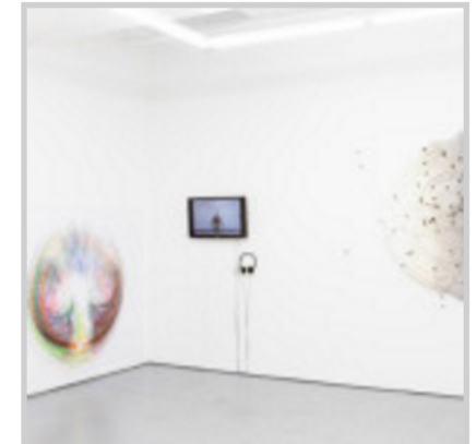
Rules of the Game at Transmitter through August 7