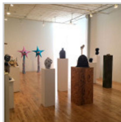
Or Bust: group exhibition at Honey Ramka through August 14