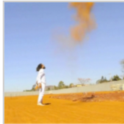
Zachary Fabri (still from video) at Field Studies: group show at Tiger Strikes Asteroid through August 7